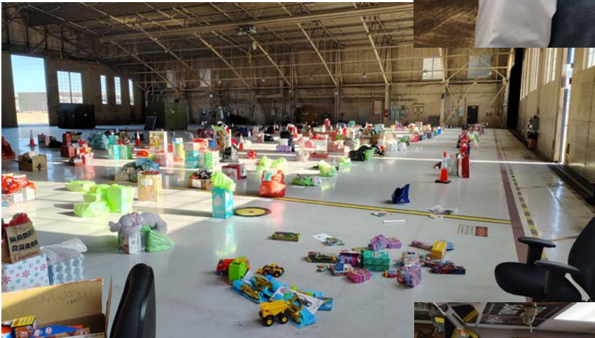
Adopt-a-Family gift donations being organized before Christmas. 381 families benefited from this - 1300+ children supported.