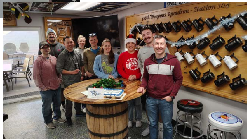
Celebrating the Space Force's 5th Birthday at the 328 Weapons Squadron with an AFA cake!