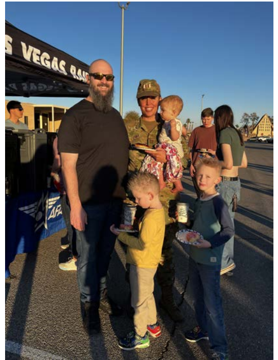
What's better than hot cocoa and trees?

This holiday season, the Air Force Association (AFA) proudly contributed to spreading joy and building community at the Holiday Salute event hosted by the Las Vegas Raiders at Nellis Air Force Base. Families gathered in the festive spirit to celebrate and make memories. The event featured opportunities to pick out beautiful Christmas trees, craft unique holiday ornaments, and share in the warmth of the season. Adding a touch of sweetness and coziness, attendees enjoyed complimentary hot cocoa and doughnuts, funded by the AFA's generous support. This partnership is a testament to the power of collaboration and community. By stepping in to provide these comforting treats, the AFA helped create a welcoming environment for military families to relax, connect, and celebrate the holidays together. As we continue our mission to support those who serve, the AFA is honored to play a small role in brightening the lives of families stationed at Nellis Air Force Base.