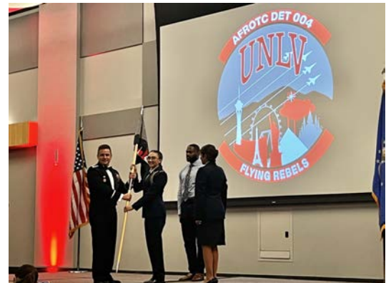
UNLV Det 004 Dining Out

AFA was proud to support and attend the Fall Dining Out dinner hosted by UNLV AFROTC Detachment 004 last month. This special event celebrated the cadets' accomplishments over the semester, marked the transition of new cadet wing leadership, and fostered camaraderie among attendees. AFA's involvement underscored our commitment to honoring the dedication and hard work of future Air and Space Force leaders, and we were grateful to celebrate this significant occasion alongside the cadets.