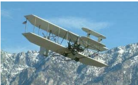
Wright Flyer Replica