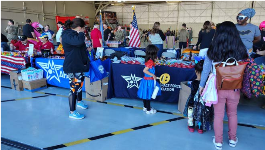
Hallocreech '24 - Creech Airmen and their families enjoyed Halloween activities in a hangar.