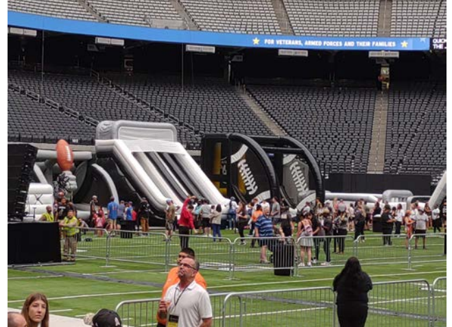
Allegiant Stadium had a wide variety of resources on offer for locals in need. Nellis AFB provided storage warehouses for 10 tractor-trailers worth of donated materials!