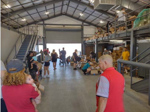
Volunteers prepare items for distribution at the Day of Gratitude at Allegiant Stadium. 29 Veteran Organizations, including AFA, were on-hand supporting the needy and volunteers.